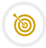
COMPETENCES FOR EFFECTIVE SOCIAL REINTEGRATION